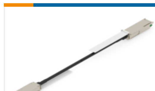
TE Part # 2053638-4 C/A, QSFP, 4M, P1-P2, UNEQUALIZED