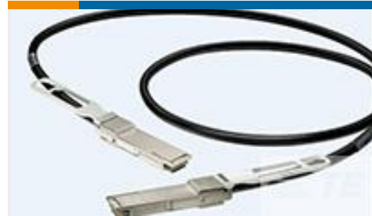
TE Part # 2829040-2 QSFP IB EDR, 33AWG, 1.0M