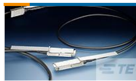
TE Part # 2202165-4 QSFP TO QSFP, 26AWG, FDR, 4.0 METER