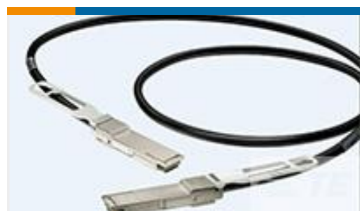
TE Part # 2829040-7 QSFP IB EDR, 26AWG, 2.0M