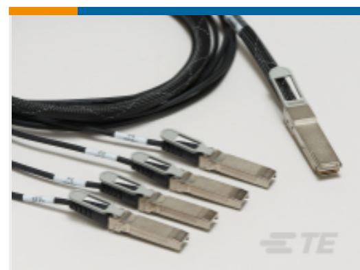
TE Part # 2821033-8 QSFP TO [4]SFP+, 28G, 1M, 33AWG