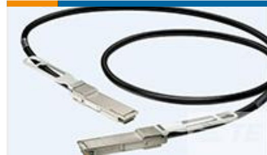
TE Part # 2829040-4 QSFP IB EDR, 30AWG, 1.0M