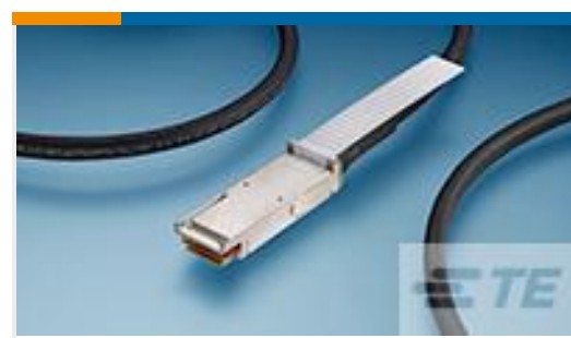
TE Part # 1-2220639-3 QSFP TO QSFP, ACTIVE, 28AWG, 13M