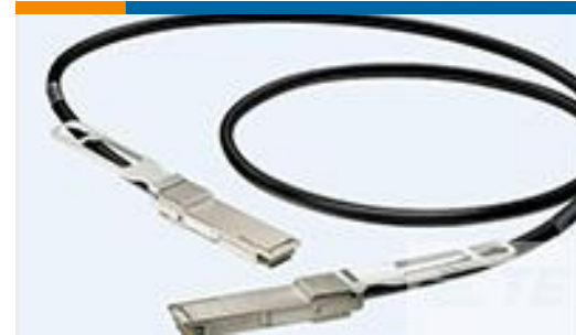
TE Part # 2829040-6 QSFP IB EDR, 30AWG, 2.0M