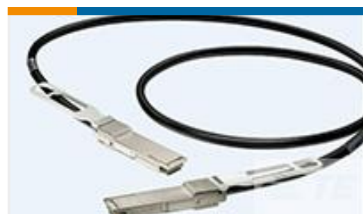
TE Part # 2829040-8 QSFP IB EDR, 26AWG, 3.0M