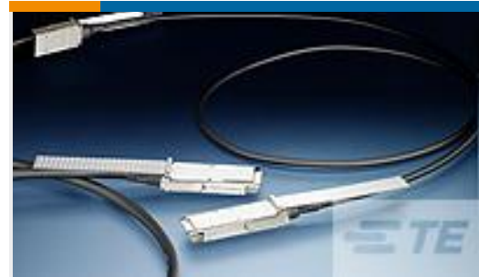
TE Part # 2202165-5 QSFP TO QSFP, 26AWG, FDR, 5.0 METER