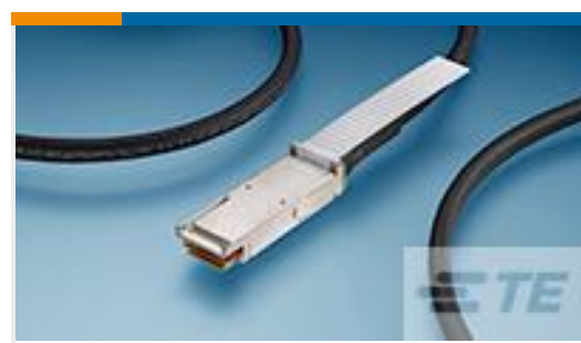
TE Part # 1-2220639-0 QSFP TO QSFP, ACTIVE, 28AWG, 10M